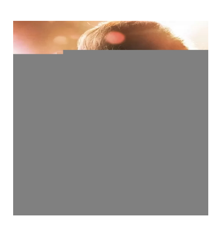
Back to Black (2024)