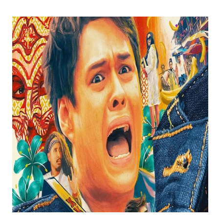
I Am Not Big Bird (2024)