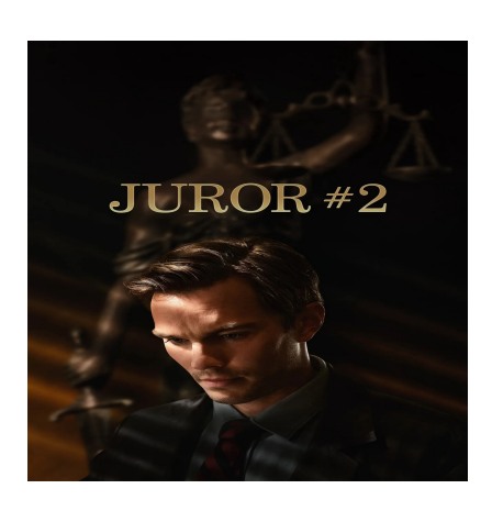
Juror #2 (2024)