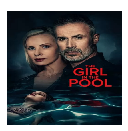
The Girl in the Pool (2024)