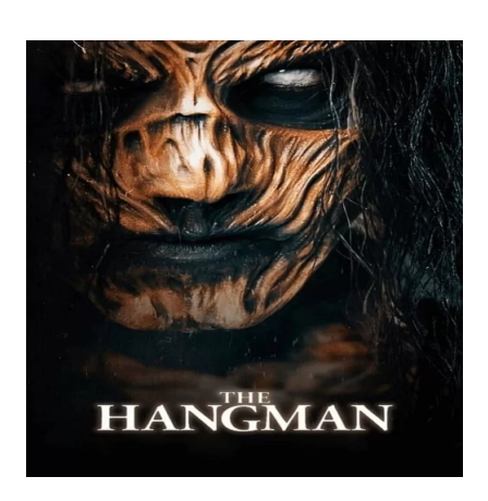
The Hangman (2024)