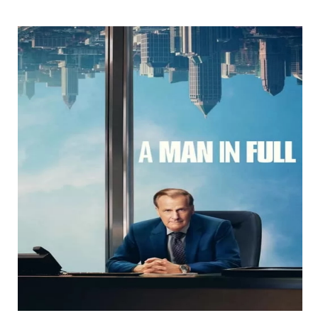
A Man in Full (2024)