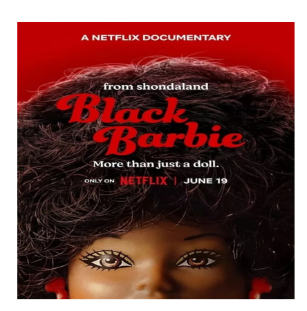
Black Barbie (2024)