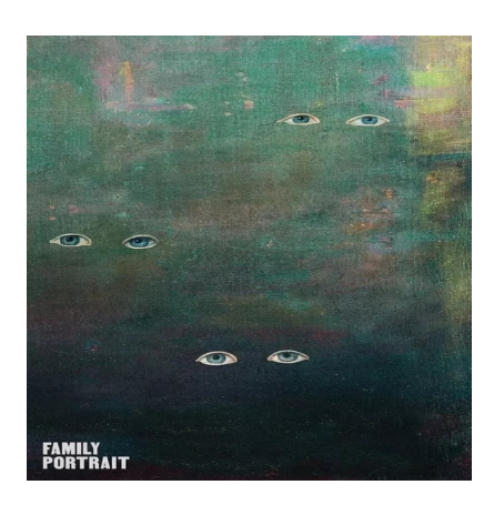
Family Portrait (2024)