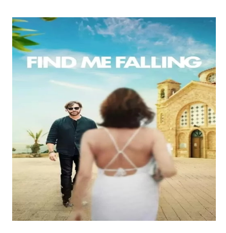
Find Me Falling (2024)