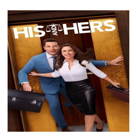
His and Hers (2024)