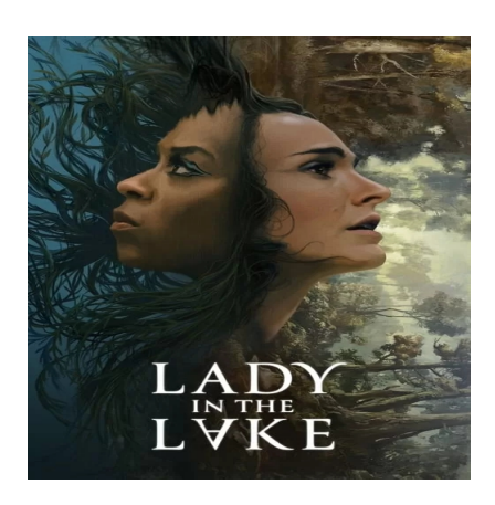
Lady in the Lake (2024)