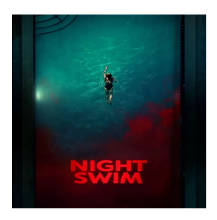
Night Swim (2024)