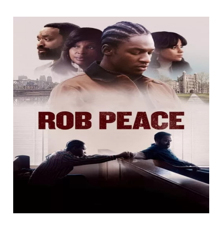
Rob Peace (2024)