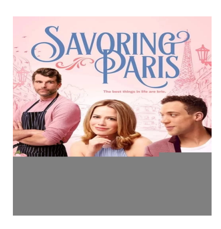
"Savoring Paris" (2024)