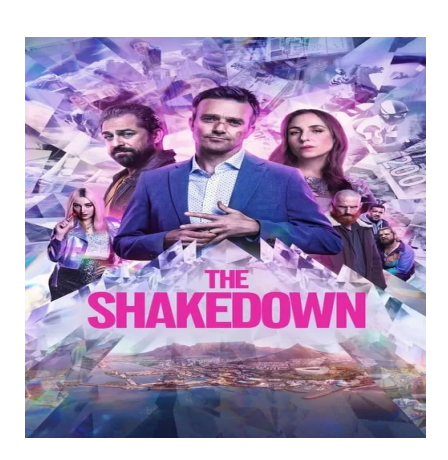
The Shakedown (2024)