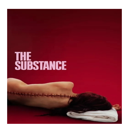
The Substance (2024)