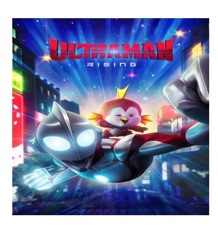
"Ultraman Rising" (2024)