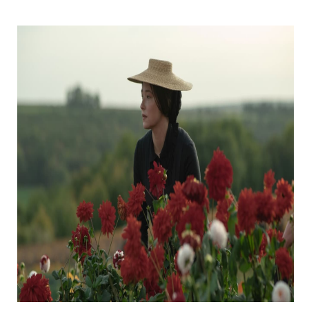
Widow Clicquot (2024)