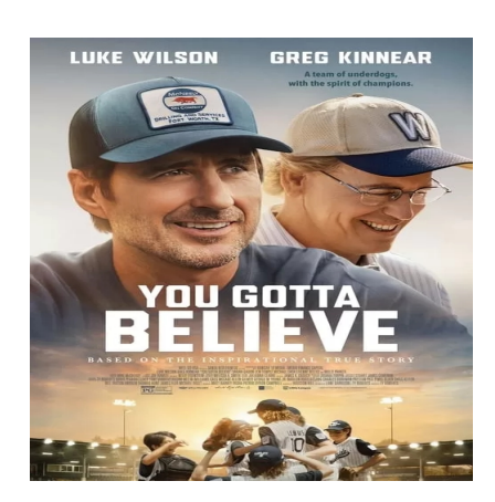
You Gotta Believe (2024)