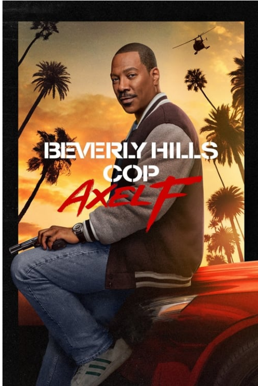
Beverly Hills Cop: Axel F