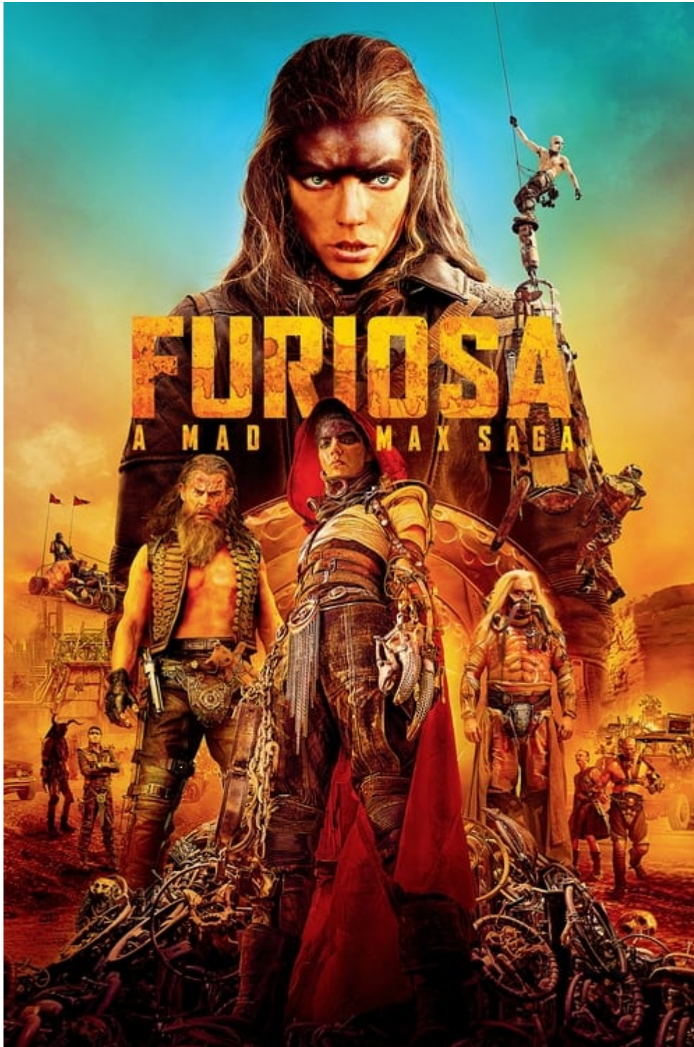
Furiosa: A Mad Max Saga